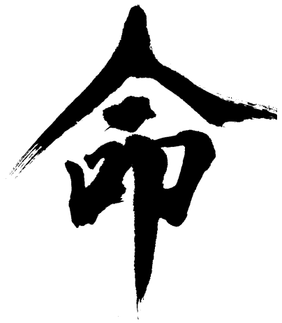
Ming Life (Destiny)

The placebo effect, spontaneous remissions and miracles provide rich food for thought regarding the “healer within” and the marvelous self-healing energies and resources that we may draw upon, cultivate and perhaps even create. In each of these areas healing occurs where no medical intervention has been utilized or where medical intervention has failed. By exploring the research on placebo, remission and miracles we gain two bits of wisdom.