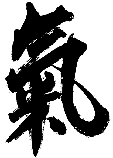
Qi Vital Life Energy

With this rigorous set of guidelines in place 64 "certified miracles" have been documented. The 25 physician members of the International Medical Commission